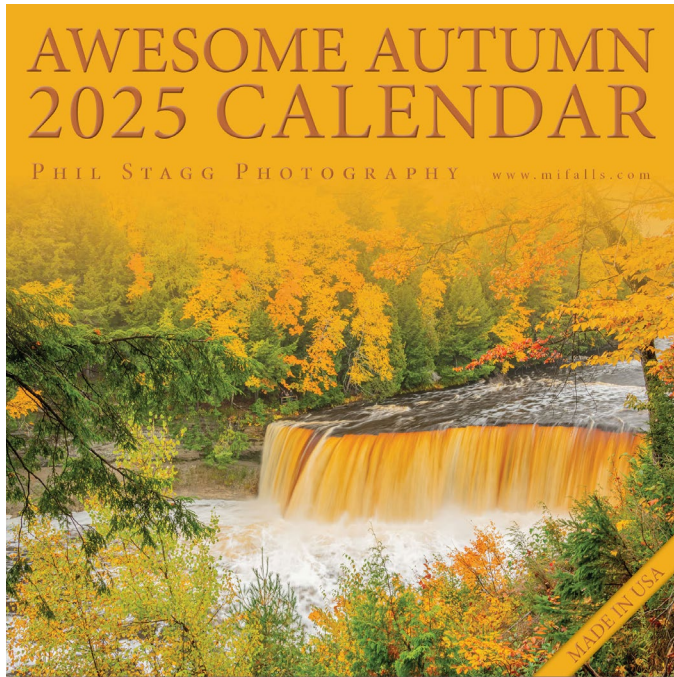
CAL 25 AA 2025 Awesome Autumn Calendar

MSRP $16.99 (priced) Wholesale $ 8.50 Guaranteed $ 9.50 10/20/40/CASE (5/DESIGN)