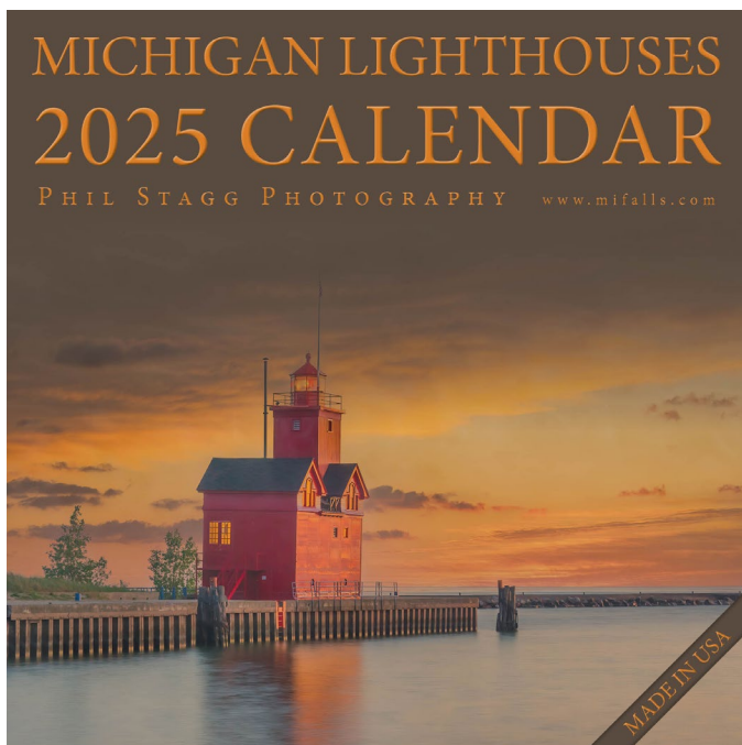
CAL 25 LH 2025 Michigan Lighthouses Calendar